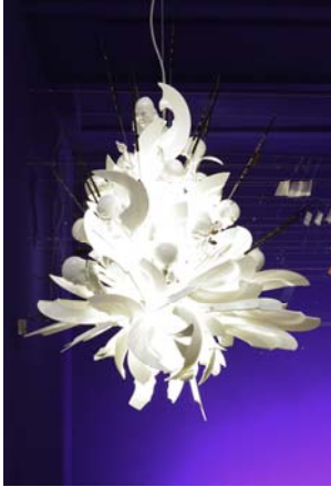
Provoking Magic: Lighting of Ingo Maurer 09.14.07—01.27.08

In order to fulfill its strategic vision of becoming the national design authority, Cooper-Hewitt will entirely revision its Web site, creating the world's most influential online resource for design education, engaging larger, new audiences with original content and facilitating access to the collection.