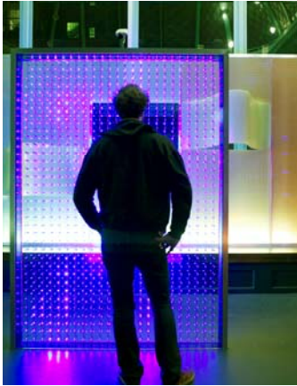
Design Life Now: National Design Triennial 2007

Cooper-Hewitt, National Design Museum is the only museum in the United States devoted exclusively to historic and contemporary design. With an internationally renowned collection of 250,000 artifacts spanning twenty-four centuries, the Museum is a uniquely valuable resource for the scholarly community and public alike. From its foundation in 1897 and subsequent assimilation into the Smithsonian Institution in 1967, Cooper-Hewitt has been dedicated to improving the quality of life through design and to enhancing the public's understanding of this most accessible form of visual culture.