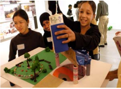
A City of Neighborhoods Education program

Mission: to advance the public understanding of design across twenty-four centuries.