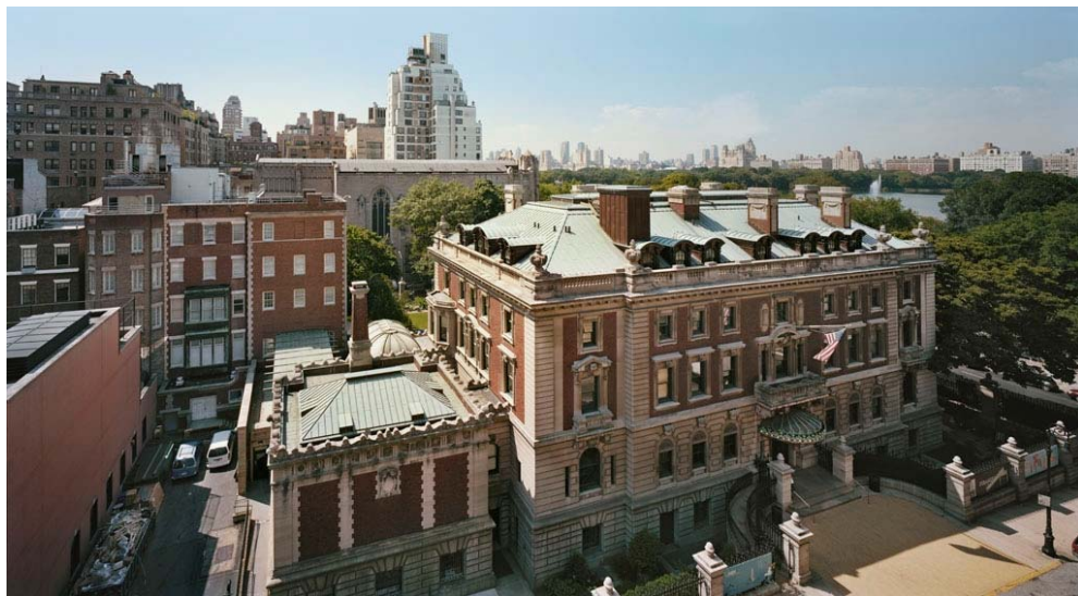
Cooper-Hewitt, National Design Museum 2 East 91 st Street, New York, NY